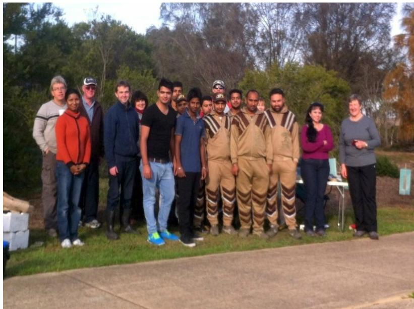
Some of the 26 willing hands helped to put in 435 plants at the bumper planting day on 24 May in Altona Meadows

"All and sundry heeded our calls and 26 willing bodies turned up to help. This was fantastic! So 435 plants went