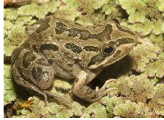
Spotted Marsh Frogs sang up a treat.

Frogs and Spotted Marsh Frogs singing up a treat - as if to welcome us to improve the site and their local habitat! I'm sure it had nothing to do with the fact that it was raining at the time :)