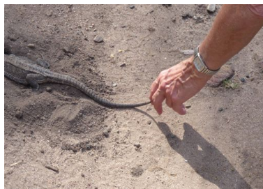
Dragon handler Len.

Friday we spent the first few hours birding on the road to Capertee adding a few birds to our trip list. We then headed for various Rockwarbler sites in the Blue Mountains but were unlucky with all of them. We spent the night at Penrith.