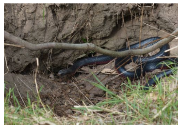
Red-bellied Black Snake

found Rockwarbler. We tried for Logrunner at the Grotto Walk but failed to find the right part of the walk before it got too late! However – it had been a good day with 3 hard to find targets seen.