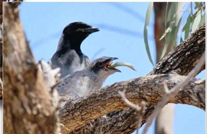
Black-faced Cuckoo-shrike and nestling