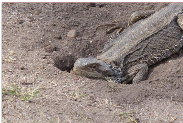
Eastern Bearded Dragon

Spring is a time for birding, so (despite recent snow in the Blue Mountains), 5 of us set off for that area on Monday 20th October. We had a list of 15 or so birds that we really wanted to see as they would be “lifers” for some of the people on the trip.