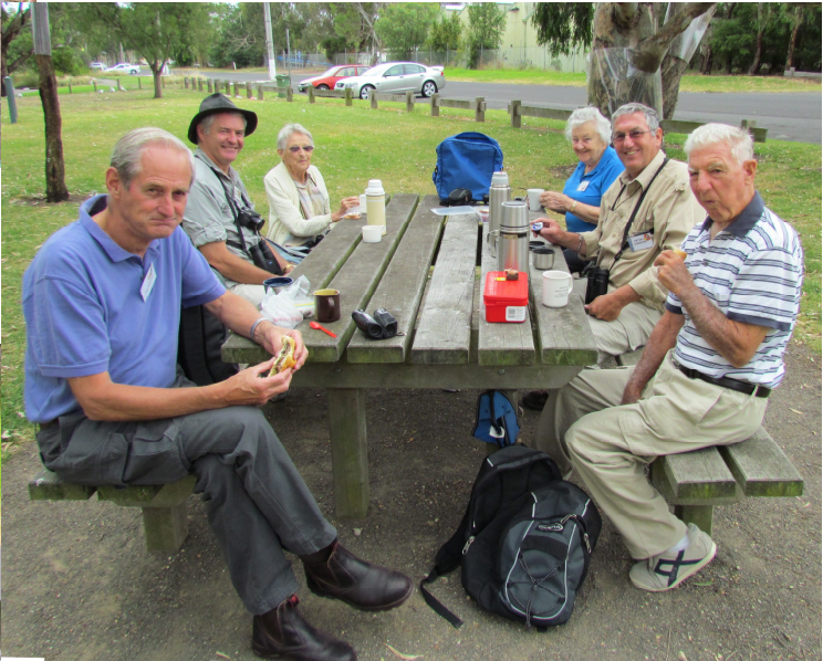
Happy Wagtails at Geelong